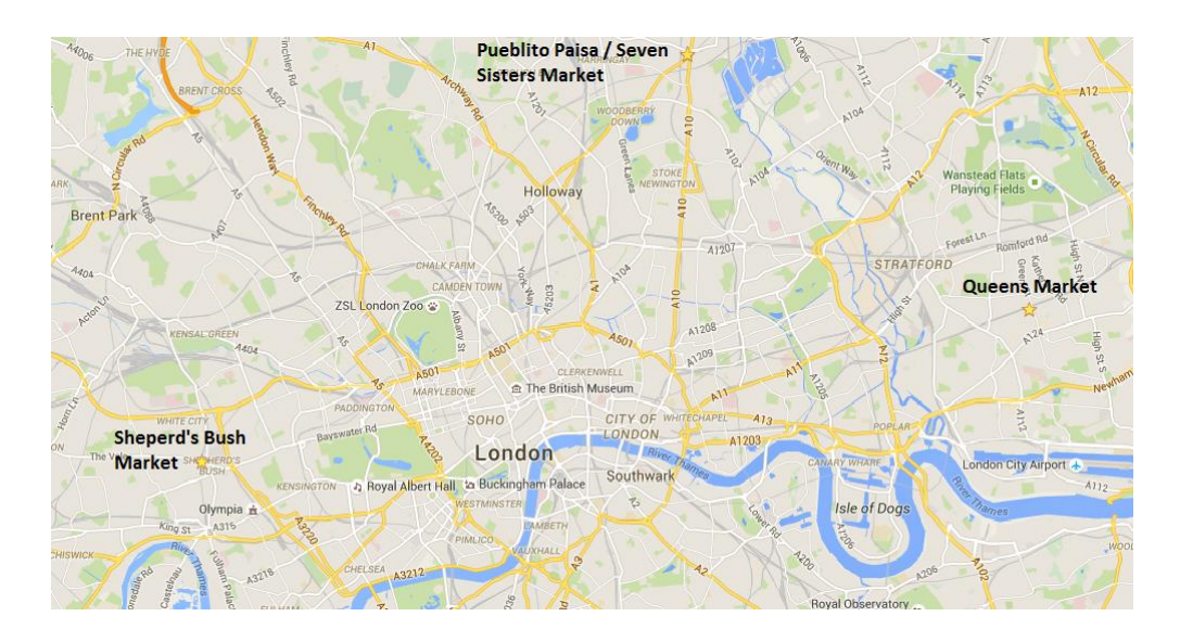
Figure 1: From Google maps

In this paper we are focusing on 3 case studies of markets and campaigns to protect or save markets: Queens Markets, Seven Sisters Markets and Shepherds Bush, all markets at the edge of central and inner London (See Figure 1).